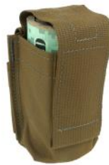
Coyote Brown SKU: SGP1-T