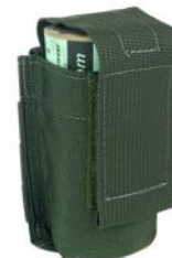
OD Green SKU: SGP1-G