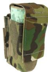
Multi-Cam SKU: SGP1-M