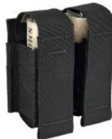
Black SKU: SGP2-B