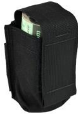
Black SKU: SGP1-B