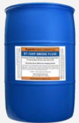
55 gal Drum