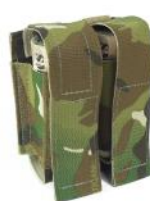
Multi-Cam SKU: SGP2-M