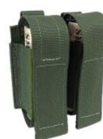
OD Green SKU: SGP2-G