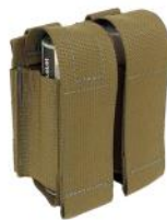
Coyote Brown SKU: SGP2-T