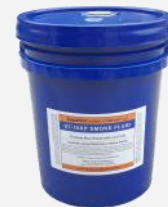
5 gal Pail